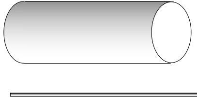
Fig. 1.2. From far away a two-dimensional cylinder looks one-dimensional.

To make contact between string theory and the four-dimensional world of everyday experience, the most straightforward possibility is that six or seven of the dimensions are compactified on an internal manifold, whose size is sufficiently small to have escaped detection. For purposes of particle physics, the other four dimensions should give our four-dimensional space-time. Of course, for purposes of cosmology, other (time-dependent) geometries may also arise.