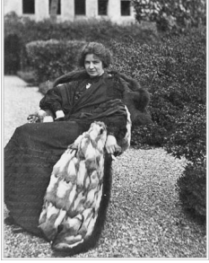
Mark Twain's older surviving daughter, Clara, was so fond of wearing black that her piano teacher in Vienna, Theodor Leschetzky, nicknamed her "Night."

As the weeks of mourning turned to months, the dark cloud slowly lifted, and he tried to shun any oppressive thoughts of death. He began to take an active part in society again, seeing old friends, going to small parties, and giving talks in New York. By the end of 1906, he was ready to make a dramatic break from the past. Going to the opposite extreme of Clara's behavior, he decided to wear only white from head to toe as often as possible. It was a sign of affirmation, a show of faith in what remained of his life.