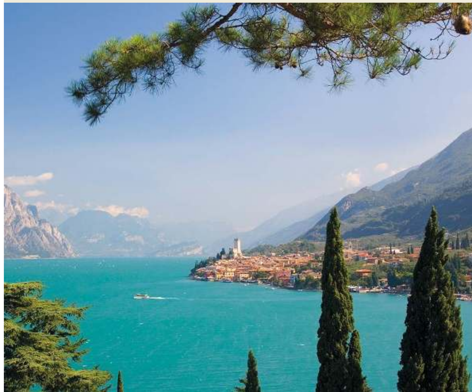
Malcesine ( Click here ), Lago di Garda